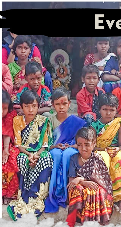
SARASWATI PUJA CELEBRATION