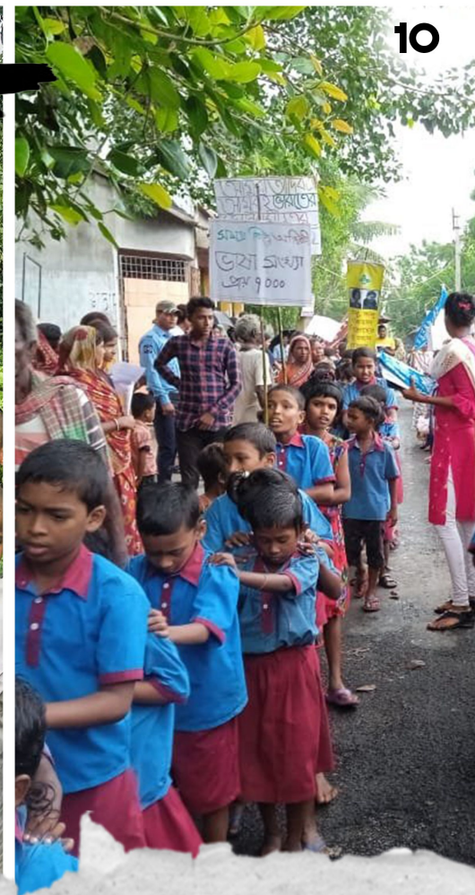
WORLD TRIBAL DAY CELEBRATION